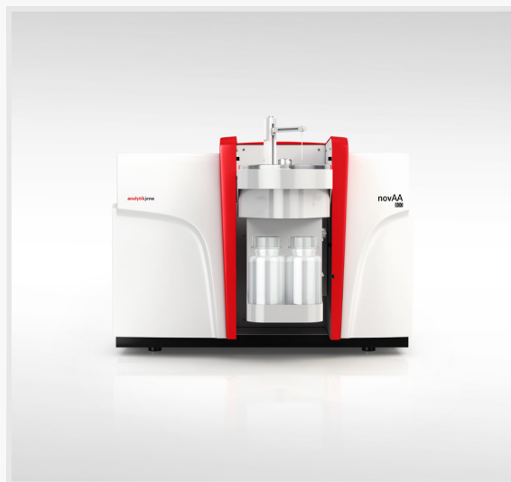
Figure 2: novAA 800 F

When the AS-FD autosampler was used alongside, both user-friendliness and productivity were significantly increased, since the autosampler offers (i) automatic over-range dilution of samples with unknown and varying copper concentrations and (ii) automatic preparation of calibration standards.