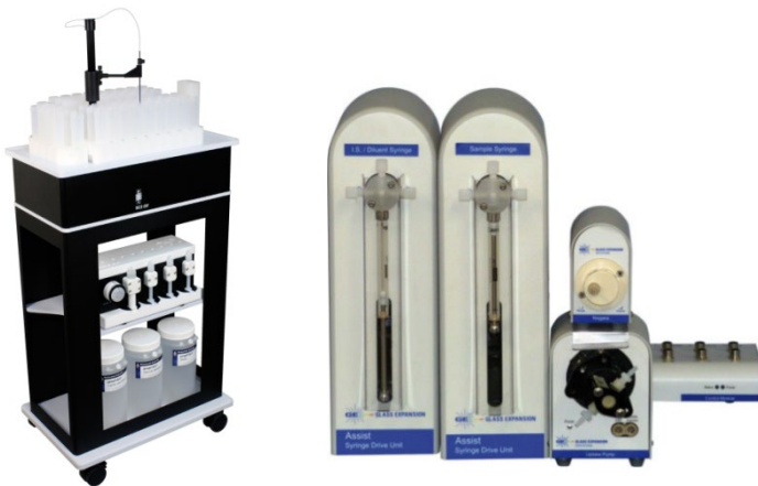
Elemental Scientific 'prepFAST' and Glass Expansion 'Assist CM' inline dilution systems

Inline dilution systems remove the need for manual dilutions by laboratory personnel for sample types such as seawater, brine solutions, effluents, soils and sediments, metals and mining samples that often exceed the TDS limit of ICP-MS. Real-time, in-line dilution also means sample analysis times are constant, independent of dilution factor.