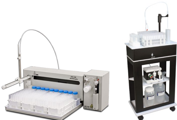
The Cetac Technologies 'SDS-550' and Elemental Scientific 'prepFAST', Offline Sample Dilution Systems

Offline dilution systems are programmable dilution systems that automate the preparation of calibration standards and samples prior to analysis by ICP-MS. Using a purpose-built software platform, method programs are developed for preparing sample batches, instructing the sampler and auto-dilution system on the volume of sample to be collected, the location of the awaiting dilution tube, which reagents to mix and the final dilution volume required for each sample. The preparation of calibration standards from bulk standards and the addition of internal standard to each solution are also possible. Preparation work is typically done offline with a dedicated PC and without being directly connected to the ICP-MS. Labor intensive sample preparation is greatly reduced for routine applications without sacrificing accuracy and precision, requiring only the transfer of prepared solution racks to the ICP-MS autosampler for analysis.