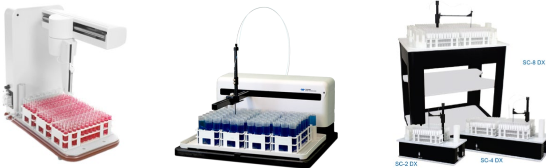
General purpose range of autosamplers from Analytik Jena, Cetac Technologies and Elemental Scientific

Autosampler enclosures are available for all models and are recommended for minimizing sample contamination. Purged systems are preferred as they create a positive pressure within the autosampler compartment, thereby eliminating dust particles from the local environment.