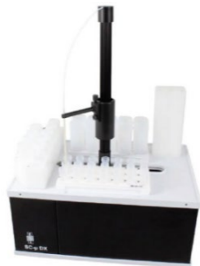
Low volume autosamplers from Cetac Technologies and Elemental Scientific