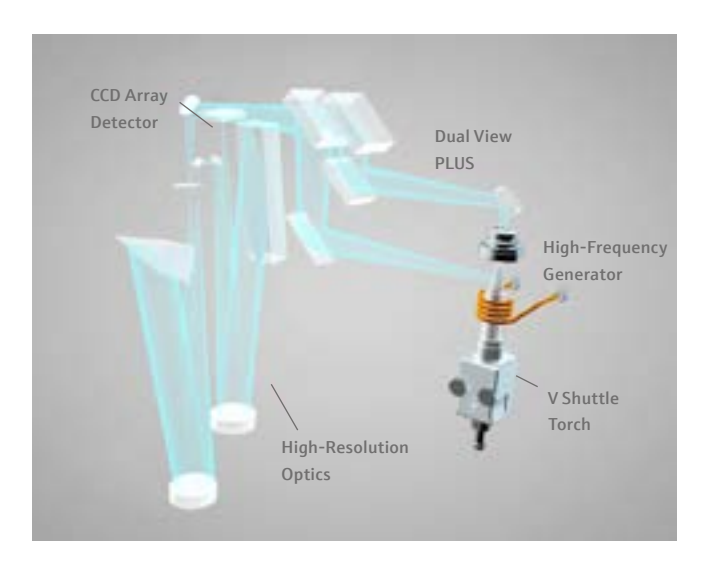
Scheme showing the main components of the PlasmaQuant 9100, including V Shuttle Torch, high-frequency generator, Dual View PLUS, and high-resolution optics.

Reliable and stable plasma performance in any sample matrix remains a challenge in ICP-OES. The high-frequency generator of the PlasmaQuant 9100 is designed to run any sample, including the direct analysis of extreme matrices. In addition to a significant extension of the application range, method robustness, precision and productivity are also enhanced by lower matrix specific detection limits and reduced sample preparation needs. Utilizing a heavy-duty four-winding induction coil, the free-running 40 MHz power tube generator readily transfers power ranging from 700 to 1700 W with the highest efficiency into plasma of exceptional length. Its unique high-power settings with instant RF power output matching, required for industrial routine analysis of materials like brines, metal concentrates and volatile organics make plasma collapse a relic of the past. Due to its fast warm-up, the plasma is stable within minutes and allows for cost-efficient shift-work operation.