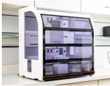
CyBio FeliX platform for liquid handling and automated nucleic acid extraction