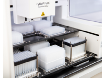
Wide variety of extraction kits with included consumables

Benefit from an automated and ready-to-use extraction solution with high yields, maximum purity and minimum hands on time.