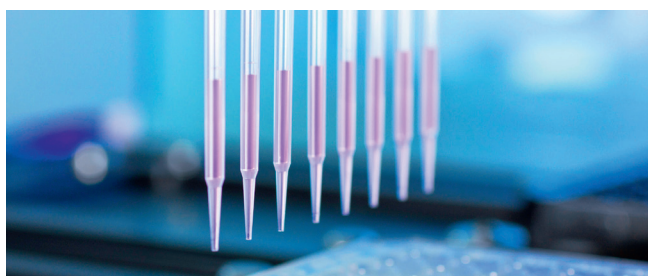
CyBi®-Felix with Head R 96/60 µl and an 8-channel adapter using 50 µl tips